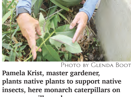
plants native plants to support native insects, here monarch caterpillars on common milkweed.

monarch caterpillar was under a common milkweed leaf at the Hollin Hall Senior Center's monarch waystation, clear evidence