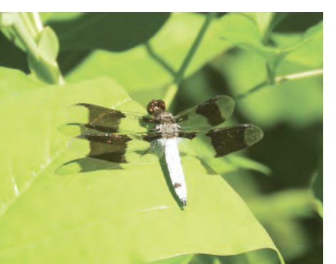
The whitetail dragonfly has a snow white Like many butterflies, tiny summer azures body and distinctive dark wing patches. get minerals from the soil.