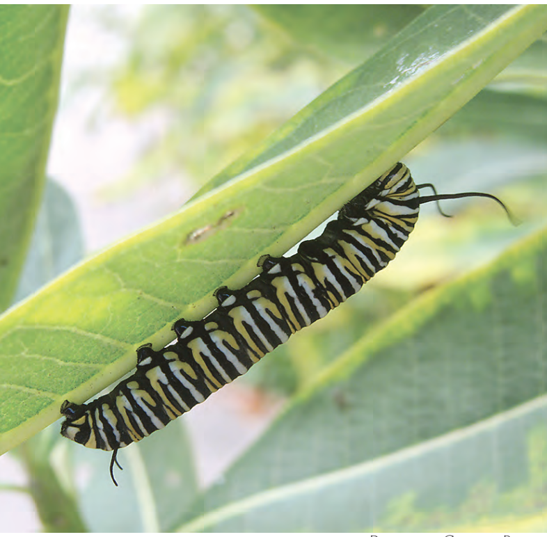
Monarch butterfly caterpillar on a milkweed leaf on Aug. 26 at the Hol-