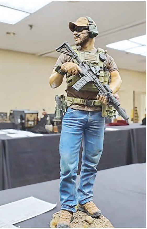
A special ops soldier in Afghanistan.