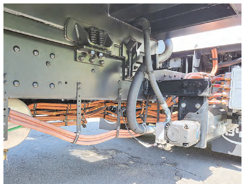
Can't have an electric vehicle without a set of wires.

But the trash must be picked up somehow. The new trucks will save all that fuel and exhaust,