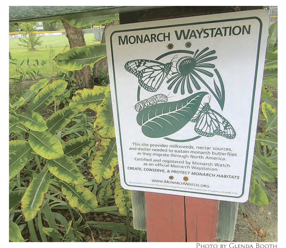
Monarch butterfly garden sign and milkweed at the Hollin Hall Senior Center