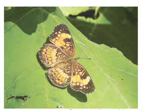
Silvery checkspot butterfly

"Butterflies are day-flying moths," he said, and both insects are in the order Lepidop-