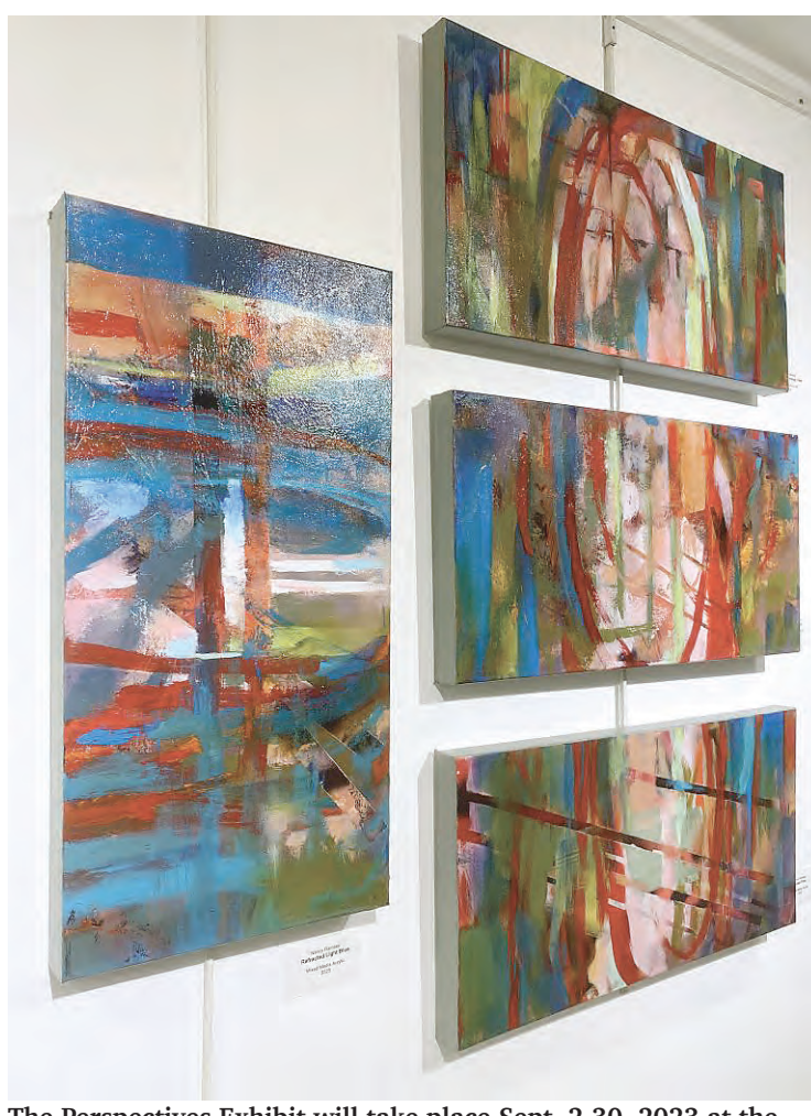
The Perspectives Exhibit will take place Sept. 2-30, 2023 at the Van Landingham Gallery in the Torpedo Factory, Alexandria.

SEPT. 1-30 The "Farther Afield" Exhibit. At Del www.ConnectionNewspapers.com