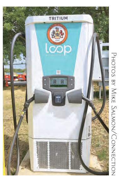
One of two special plug-in stations.